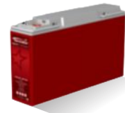
NSB 210FT HT RED