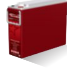
NSB 100FT HT RED