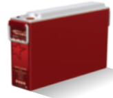
NSB 190FT HT RED